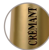
Embossing on skirt with or without printing