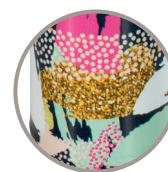
4-color (CMYK) printing