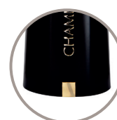
UV spot to align your label with your hood design

Up to 6 colors on skirt / 3 colors on head